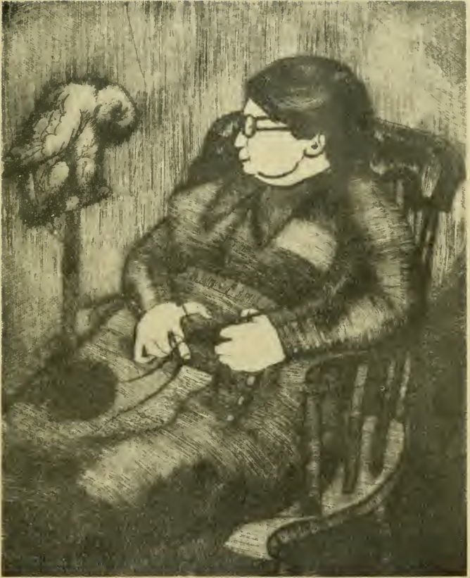
“ AN OLD LADY WHO LIVED ALONE WITH HER PARROT ”